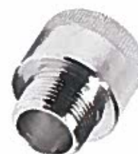
28S-0350 Bushing Adaptor