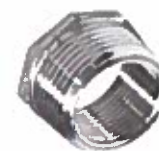
28R-2404 Bushing Adaptor